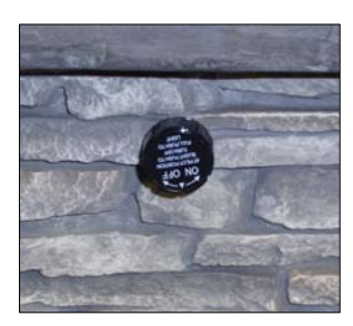
Fig. 1 Valve Control Knob