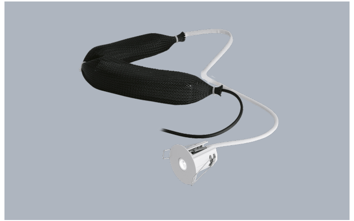
2W 3 Hour Non-Maintained Emergency