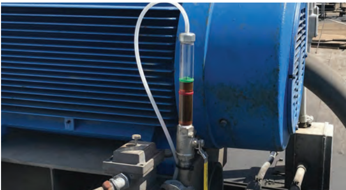
Vent Tube Option - Cooling Tower

The Column is a 3D sight glass designed for monitoring of fluids with greater fluctuations in level. The Column can be installed at the drain port or anywhere below the oil level. Included red and green level rings provide easy monitoring of the level between idle and running conditions. The level rings have a tamper-proof design to prevent accidental adjustments. The top of the Column includes either a 3-micron stainless breather or a vent tube kit for plumbing the air back to the headspace of the oil reservoir. The Column is made of the crystal-clear and chemically resistant Tritan™ material with 1" NPT threads for extra durability and also includes zinc-plated or stainless steel steel thread reducers. The Column works great with Luneta's Hub and Bowl. There is also a bypass tubing kit so the Column can be used in conjunction with a filter cart.