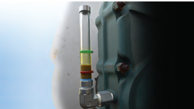
3-Micron Breather Option - Speed Reducer

Available Male Thread Size: NPT 3/8", 1/2", 3/4" and 1" Available Lengths: 3", 6", 9", 12", 15", 18", 24", 36", 48" and 60" (custom lengths are also available)