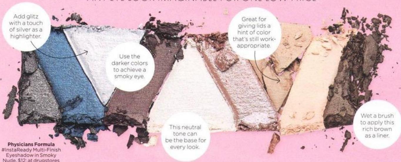
Physicians Formula #InstaReady Multi-Finish Eyeshadow in Smoky Nude, $12; at drugstores

WHY SHELL OUT FOR A GAJILLION DIFFERENT SHADOWS? THIS LINEUP OF SHADES ALLOWS YOU TO CREATE JUST ABOUT ANY EYE LOOK IMAGINABLE FOR ONE LOW PRICE