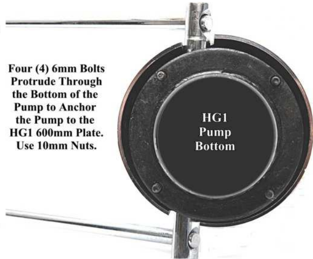
HG1 Pump Bottom

A = 4.50" B = 3.50" C = 3.75" D = 23.60"