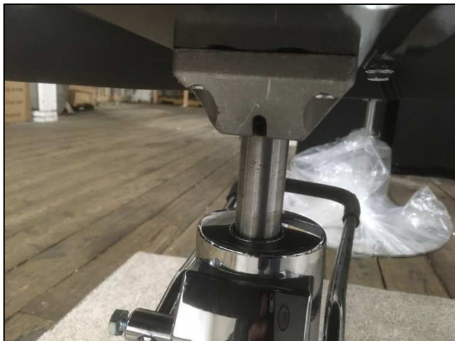
Image shown on left is what your finished assembly should look like. TIP : sit in the chair and gently "BOUNCE" up and down in order to connect the chair-top to the pump shaft. This completes the assembly.

Once the footrest is installed take the chair-top and set it on top of the pump-shaft as shown, lining up the SLOT with the PIN . ( NOTE : The SLOT should be facing toward the FRONT of the chair)