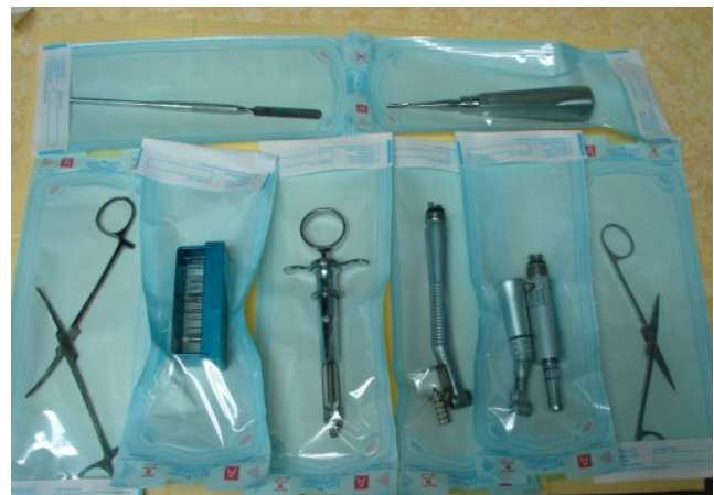
Fig. 2: Instruments that are often bagged individually include (clockwise from top left) a cement spatula, an oral surgery elevator, scissors (opened up to expose blades to steam), a slow-speed contra-angle handpiece (bagged in two separate parts), a high-speed handpiece, a syringe, a bur block and a hemostat (open in the bag).

Burs can be bagged by putting a bunch of them in a bag, or by arranging them in a sterilizable bur container called a bur block ( Fig. 2 ). A bur block should ideally have holes for high speed (friction grip) burs, which are small in diameter, and low-speed (latch or contra-angle) burs, which are slightly larger in diameter.