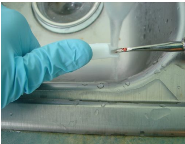
Fig. 8: Cleaning fresh blood off an oral surgery elevator, by placing the elevator tip inside an HVE suction inlet while tap water is sucked into the inlet over the elevator tip.

Instruments that have fresh blood on them after a procedure, such as periodontal hand scalers or oral surgery instruments, can be easily cleaned by placing the tip of the instrument in the inlet of a high volume suction tube under a tap water spout, so that water is sucked into the inlet and flows rapidly and forcefully over the tip, washing away the blood ( Fig. 8 ).