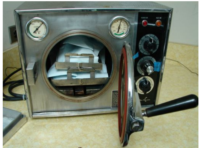
Fig. 4: This autoclave has been loaded with bagged unsterilized instruments separated with two shelves. The red ring inside the door is a silicone gasket that helps seal the autoclave door, preventing water or pressure leakage.

If an autoclave is leaking water or pressurized steam from the autoclave door, or is taking more time to pressurize or heat up, the dentist may need to replace the autoclave gasket. This is a silicone ring that is put around the inside of the autoclave door to help seal the door to prevent such leakage ( Fig. 4 ). Sometimes, as a stop-gap measure, the assistant may stretch out the gasket to expand its diameter slightly, so that it fits with more snugness into the autoclave door. There should be backups of the gasket at all times in the office.