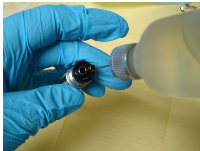
Fig. 7: Lubricating a hand-piece with a few drops of hand-piece lubrication oil placed in the small hole at the end of the hand-piece.

Handpieces should be lubricated before sterilization, by putting handpiece lubricant in the small hole of the part of the 4-hole handpiece that attaches to the dental chairside unit ( Fig. 7 ). A spray-on mini-straw can be used to spray pressurized handpiece cleaner inside the handpiece to clean debris from the tip of the handpiece and the turbine inside the handpiece head, although this vaporized material contains solvents and should not be breathed in.