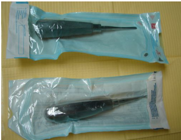
Fig. 9: A correctly bagged oral surgery elevator (top), where the tip is fully visible. When incorrectly bagged (bottom), the tip is located at the bag opening and is covered by the adhesive paper that seals the opening.

In general, instruments should be placed in a sterilization pouch tip-side-down, such that the instrument tips or working ends are visible through the plastic, and not covered by the paper of the autoclave bag seal ( Fig. 9 ). This is important with instruments that are bagged individually, such as oral surgery elevators and forceps, where the dentist will need specific sizes of instrument tips to perform specific tasks, and will not be able to quickly see the tips of instruments hidden under the autoclave paper.