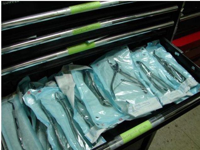
Fig. 5: Sterilized autoclaved bags should be stored plastic-side up in a flat drawer, such that instruments are instantly visible through the plastic, and not bunched together, which would prevent easy location of an instrument.

Some assistants temporarily place sterilized bagged instruments on top of the autoclave, paper-side-up, to give them time to dry, then after drying place them in their designated storage areas in the office. If this is done often in an office, then the office should as a policy designate the top of the autoclave as a clean surface and never place unsterilized or bagged but unsterilized instruments on top of the autoclave. However, if an instrument is still hot when placed in its designated storage area, paper-side-up, the heat in the instrument will usually make all of the moisture in the bag evaporate through the paper, without needing to temporarily store the instrument on top of the autoclave to dry.