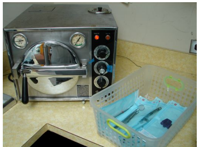
Fig. 6: An autoclave is on and sterilizing instruments, while a small plastic basket with bagged but unsterilized instruments is next to the autoclave. The top left gauge above the door shows the pressure, while the top right gauge above the door shows the temperature.

The author suggests the office has many labelled 2.0 inch high drawers for storing bagged sterilized instruments face-up for easy locating, instead of bunching bagged instruments in a big drawer, making them hard to find ( Fig. 5 ). Some offices store bagged