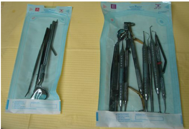
Fig. 1: Example of a basic setup bagged separately in a 3.5"x10" bag (left), versus the basic setup bundled in a 5.5"x11" bag with the other instruments of an amalgam restorative dentistry setup (right).

An office could also combine these styles, by both bagging syringes and basic setups separately, and also having some large procedure bags containing the specific instruments needed for a procedure combined with a basic setup in the same bag ( Fig. 1 ). This is perhaps most flexible for the dentist logistically.