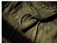
Thumb hole detail