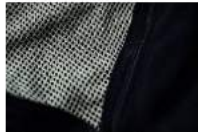
Wool mesh lined