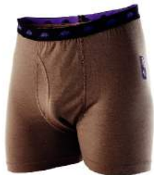
Armadillo Merino® Champion Geoff Perrin

Protect your bottom half with our 100% merino wool bottoms. Designed to be worn under uniforms or outer layers, our bottoms are comfortable and have unrestricted movement with a gusseted crotch.