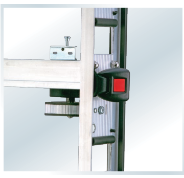
Auto-Rewind Safety Strap RW-1: 12 ft. long nylon automatic rewinding safety strap. Upper, middle and lower positions available for maximum versatility.