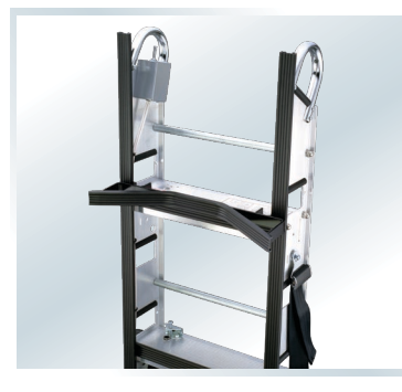
Barrel Attachment BAR-1 / BAR-2: Concave, padded brace stabilizes cylinder-shaped loads. Used for water-heaters, barrels and drums.