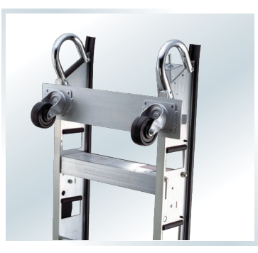
Swivel Caster Attachment SCA-1: Attaches easily to the back of the hand truck near the top handles. Allows the hand truck to lay flat and roll in a horizontal position.