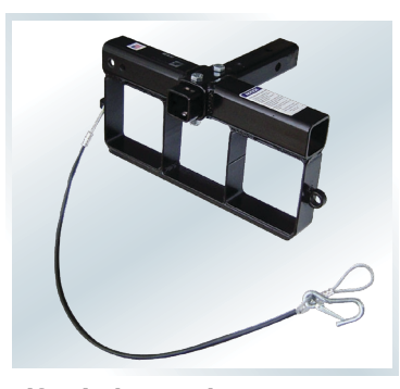
Lift Hitch Attachment LH-3: Carries Escalera Forklifts on the back of delivery vehicles. Fits standard 2" receiver (for fork lift models only).