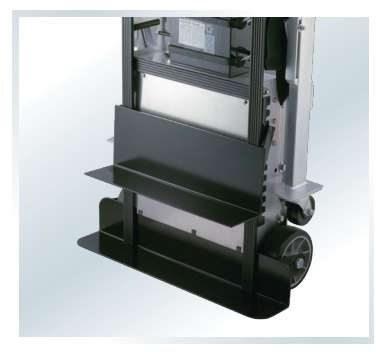
Height Adjustable Toeplate HAT-1: For moving loads with legs, such as furniture and snack vending machines.