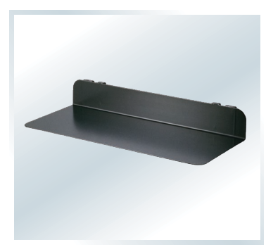
Big Toeplate Attachment BTA-12-28 / BTA-12-32: Large removable toeplate fits over standard toeplate. Available in 2 sizes; 12" x 28" and 12" x 32"