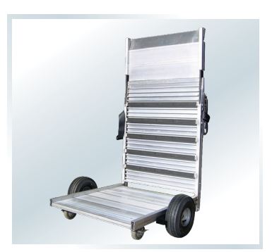
Escalera CopyCaddy™ RPA-1 / RPA-2: Delivery cart/ramp for copy machines and large electronic equipment. 2 pallet sizes and 10″ extensions available. Includes all-terrain tires, and adjustable strap.