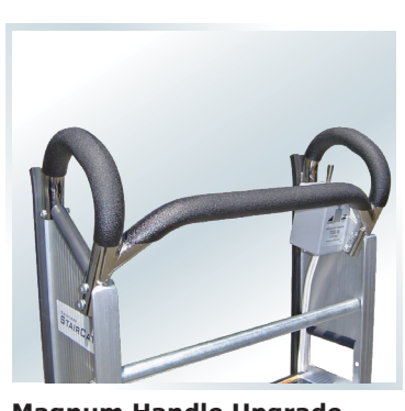
Magnum Handle Upgrade #1305 / #1307: No-slip coated handle with wider opening. Replaces standard chrome top handle. Cross-bar option available (#1307).