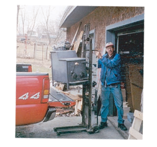
Model: RLA-HC with lift attachment removed