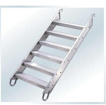
Portable Steps Custom designed aluminum steps available in various sizes to fit most delivery vehicles ranging from small pick-ups to large delivery trucks.