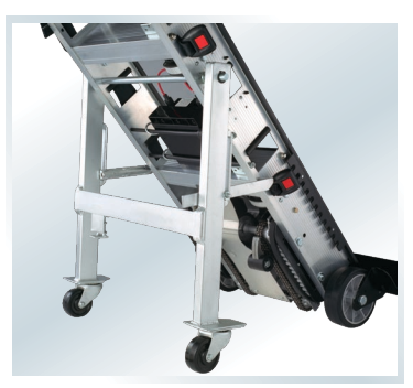
Retractable Load Support RLS-1: Wide track folding carriage legs with swivel casters. Footoperated latch allows for easy deployment without uprighting load.