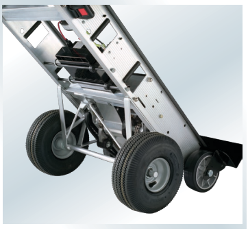
Big Wheel Attachment BWA-1: Removable pneumatic 10" tires for rolling on rough terrain. Easily snaps on/off hand truck in 2 seconds.