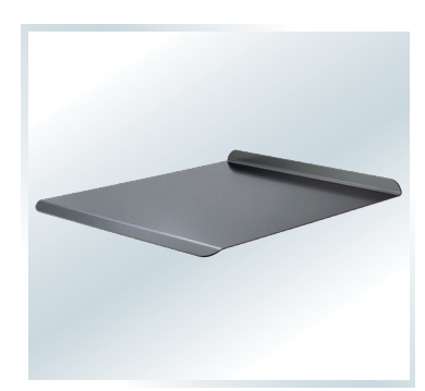
Lift Plate Attachment LPA-1: Removable 24" x 28" steel platform locks on to forks (for fork lift models only).