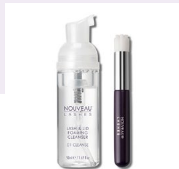
Lash & Lid Cleanser Set

To help you get the perfect lash care routine, we've created a range of handy bundles with the ultimate product combinations.