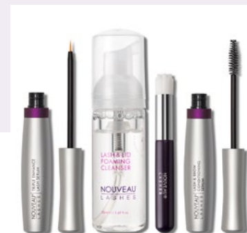
Complete Lash Essential Collection