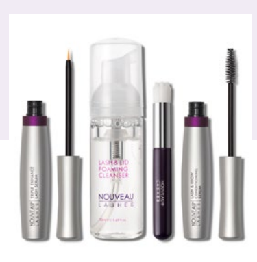
Complete Lash Essential Collection