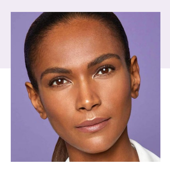
LVL Lash Lift

On top of our lash care range, we also offer a range of salon treatments to help everyone achieve their dream lashes.