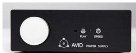
DIVA II SP PSU FRONT

DO NOT SEE HOW FAST OR HOW SLOW THE UNIT WILL OPERATE AS THIS COULD CAUSE THE UNIT THE MALFUNCTION AND WILL NOT BE COVERED BY OUR WARRANTY.