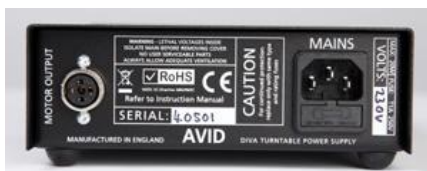
DIVA II SP PSU REAR