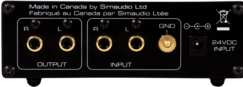
Figure 1: MOON 110LP v2 back panel