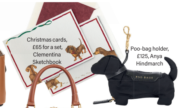
Christmas cards, £65 for a set, Clementina Sketchbook