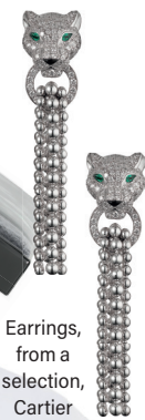
Earrings, from a selection, Cartier