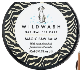
Wild Wash paw balm for dogs, £14.95