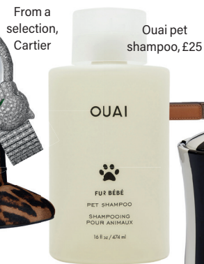
Ouai pet shampoo, £25