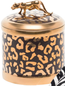
Candle, £160, L'Objet