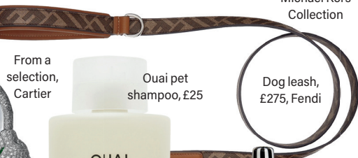
Dog leash, £275, Fendi