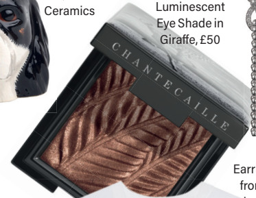
Chantecaille Luminescent Eye Shade in Giraffe, £50