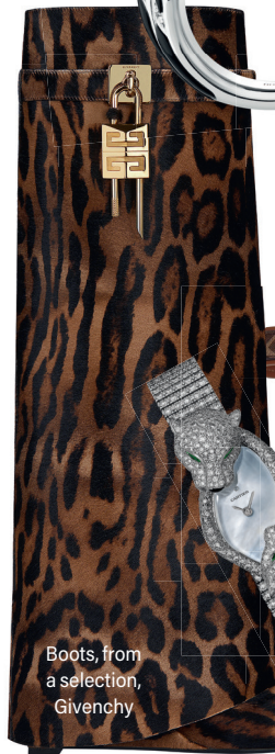
Boots, from a selection, Givenchy