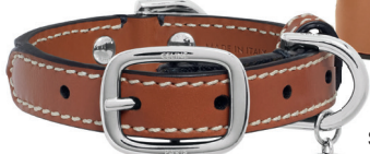
Dog collar, £490, Celine by Hedi Slimane