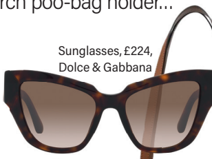
Sunglasses, £224, Dolce & Gabbana