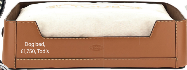
Dog bed, £1,750, Tod's