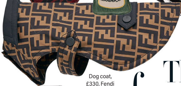
Dog coat, £330, Fendi