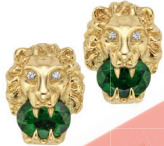
Earrings, £2,840, Gucci