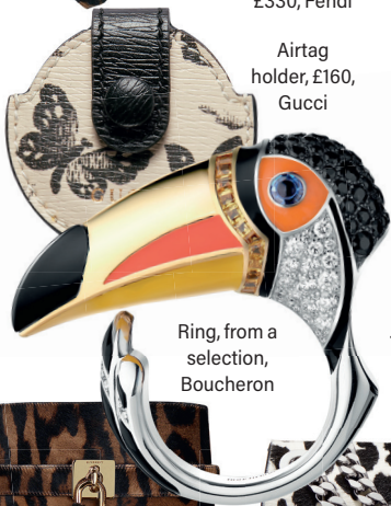
Airtag holder, £160, Gucci