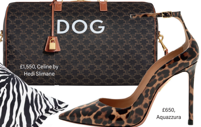
£1,550, Celine by Hedi Slimane