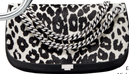
£855, Michael Kors Collection