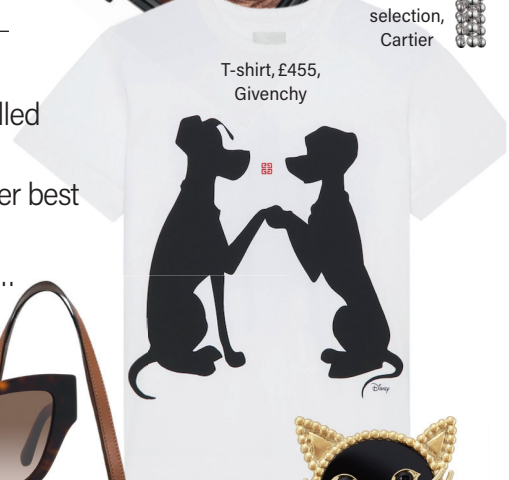
T-shirt, £455, Givenchy