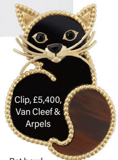
Clip, £5,400, Van Cleef & Arpels