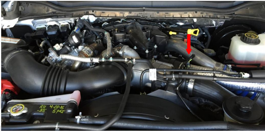
2017-2020 6.7L Powerstroke Charge Air Cooler Sensor Sensor is located on the top of the connector at the engine throttle body