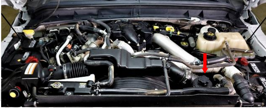
2011-2016 6.7L Powerstroke: Charge Air Cooler Sensor is located on the lower firewall side of the cold side intercooler tube.