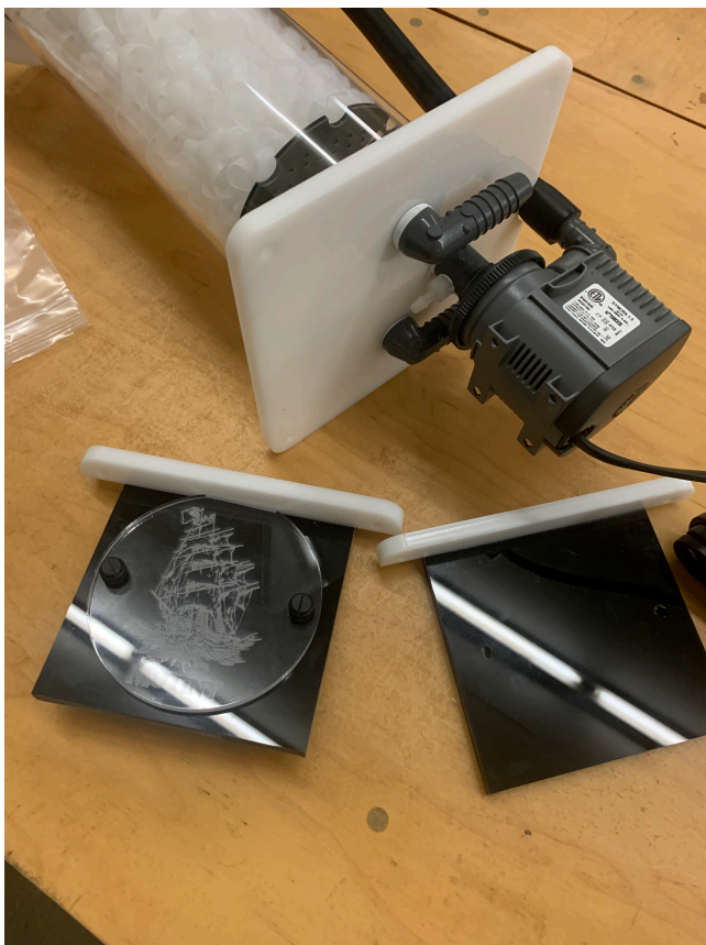
Align the reactor body and connected pump with the stand.