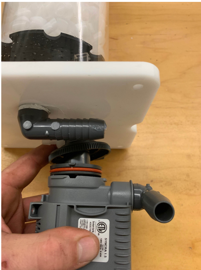
Connect the motor block to the pump volute which is pre-installed on the reactor bottom plate.