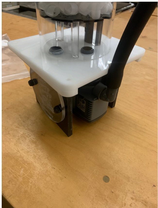
Reactor body on base. Turn the output barb fitting 90 degrees to face upwards.