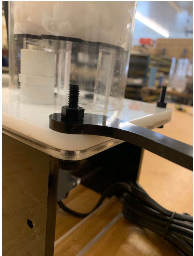
Carbon bracket non-removable side. The nut goes on top.