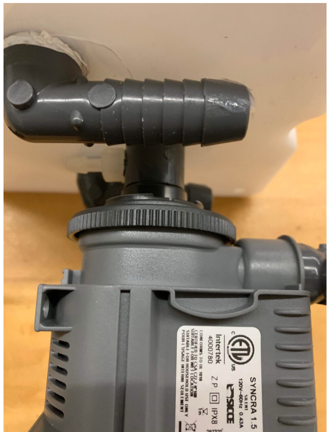
The volute twist locks onto the pump motor block.