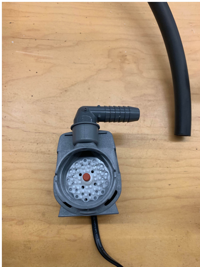
Pump motor block with impeller. Note the red bushings in place on both ends. Don't lose these!