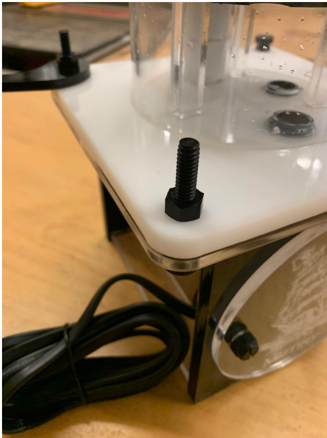
These thumbscrews install from the bottom. Note the position of the nuts to align the carbon reactor bracket.