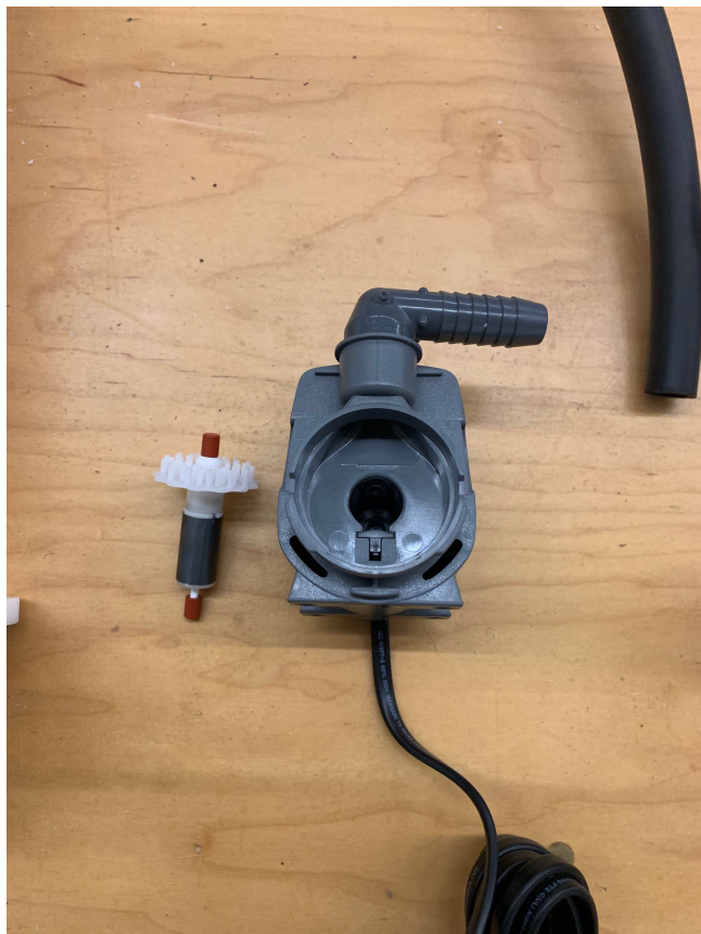
Install the impeller into the pump motor block.