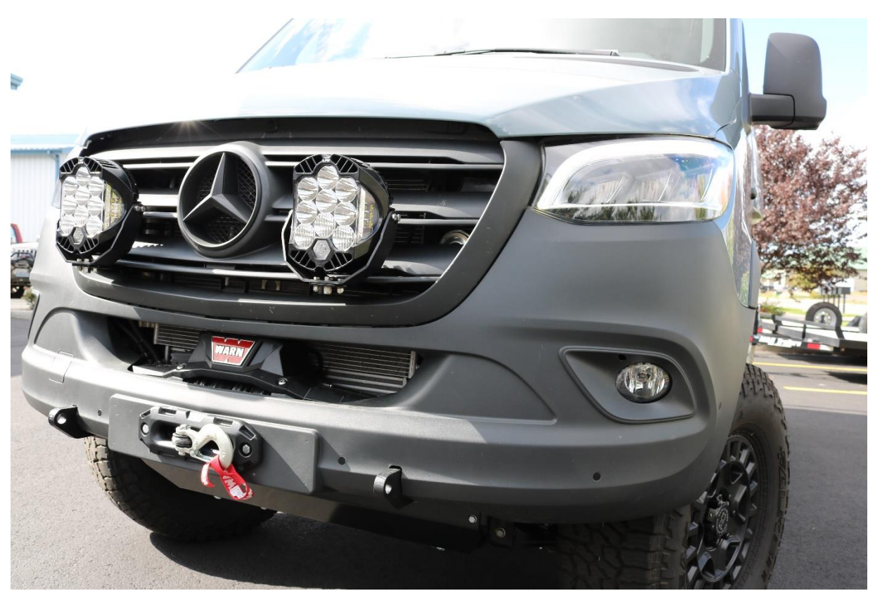
Installation is Complete