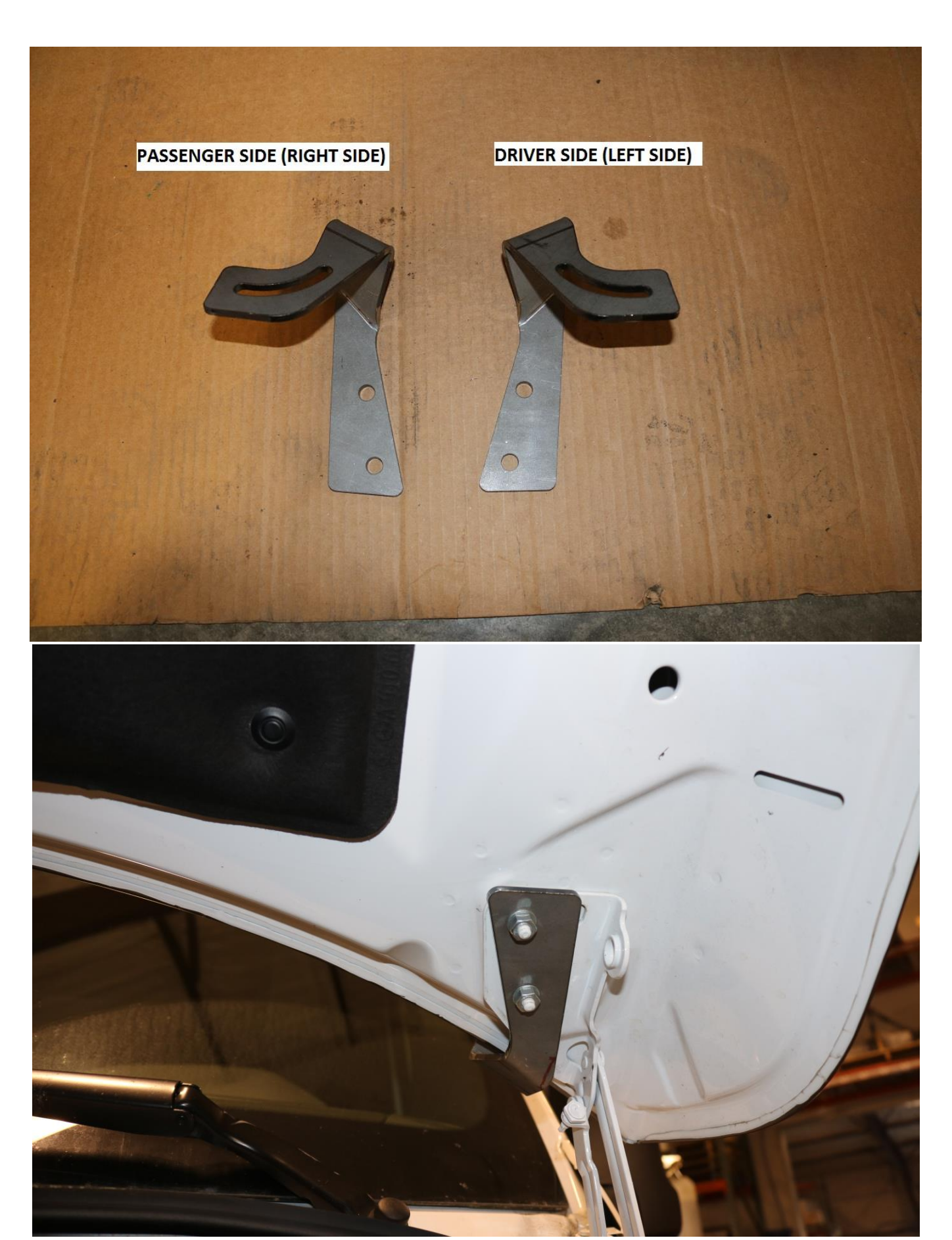
4) Once the bracket and nuts have been installed, torque the nuts using a 13mm socket to 13 ft-lbs (17.6 N.m)