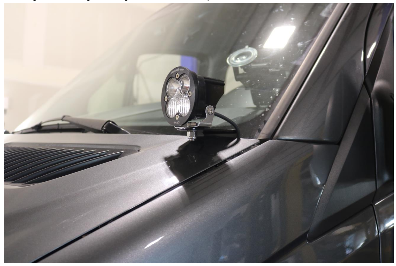
<u>Installation is Complete</u>

6) Wire lights according to the light manufacturer's specifications.