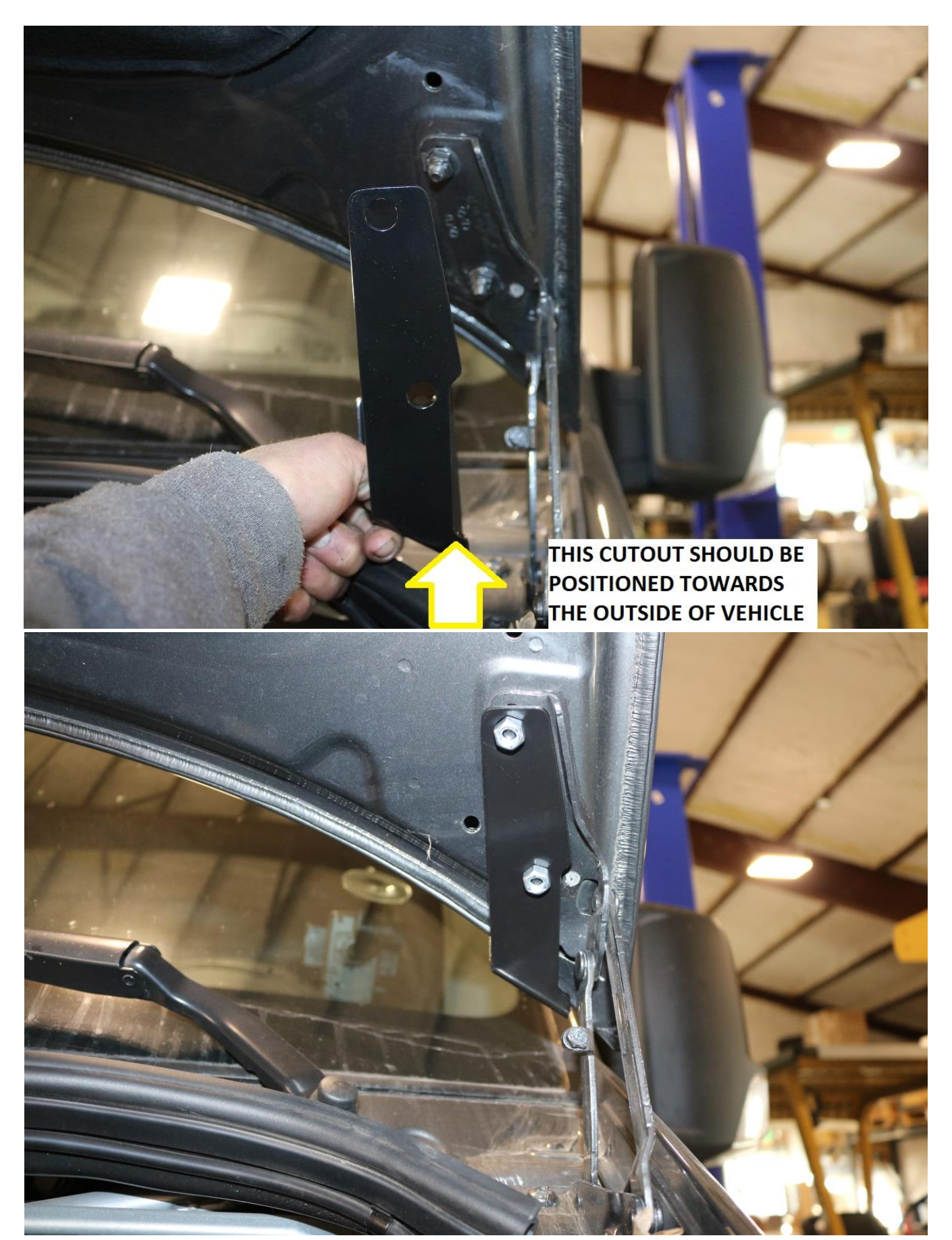
4) Once the bracket and nuts have been installed, torque the nuts using a 13mm socket to 10 ft-lbs (13.5 N.m)