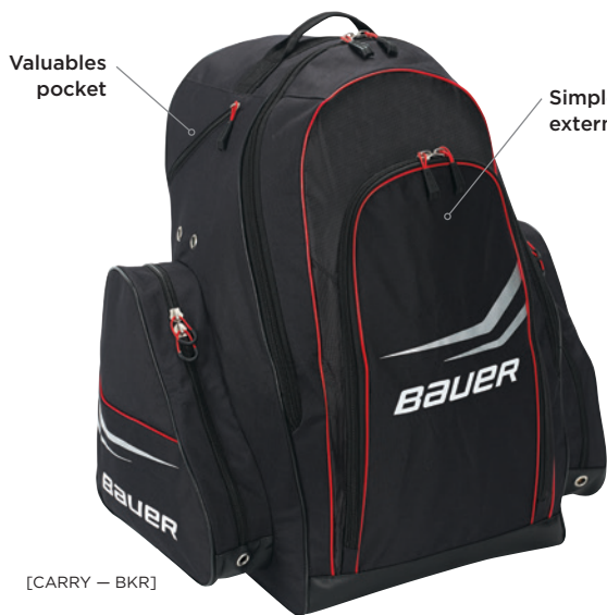
[CARRY — BKR]