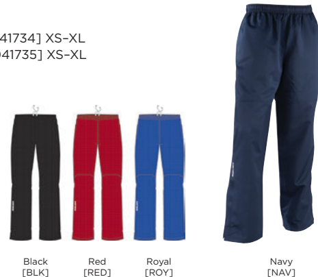
Black [BLK] Red [RED] Royal [ROY] Navy [NAV]

Coordinates well with all three BAUER Team Jackets Inside mesh lining is treated with 3M™ Scotchgard™ Protector moisture wicking finish Hidden zippers are set 2.5" above the bottom of each leg opening to allow for easy alteration 2 on-seam pockets, 1 back pocket with zipper closure