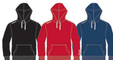
Black [BLK] Red [RED] Navy [NAV]

Made from soft brushed 80% cotton, 20% polyester 300 gram fleece Front kangaroo pocket