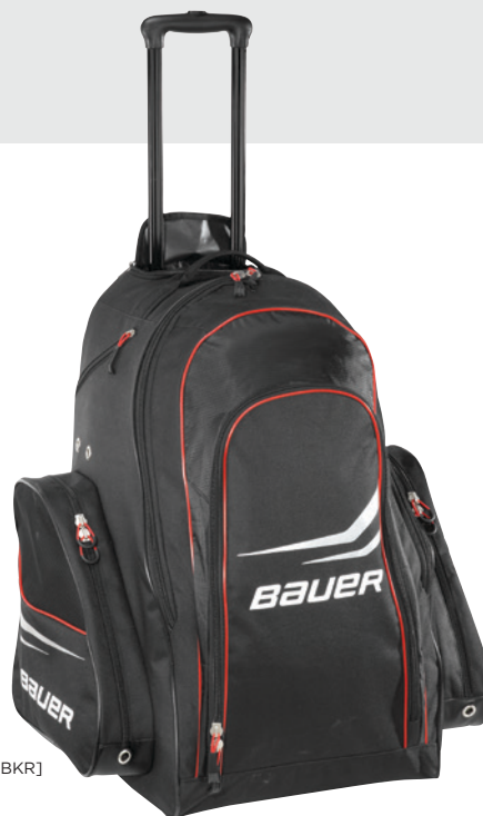
[WHEEL — BKR]