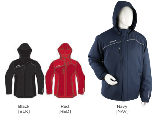
Black [BLK] Red [RED] Navy [NAV]

Heavyweight winter jacket with detachable hood Lined with quilted polyester taffeta and filled with 150gsm 3M™ Thinsulate™ Insulation for warmth 3M™ Thinsulate™ Insulation is breathable, retains insulating abilities even under damp conditions and dries easily