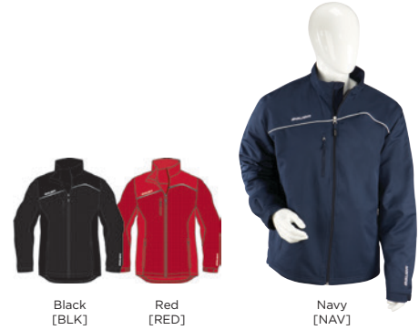
Black [BLK] Red [RED] Navy [NAV]

Fully lined with polyester micro-fleece, the Midweight Jacket is comfortable, warm and perfect to wear both inside and outside the rink