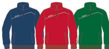
Navy [NAV] Red [RED] Green [GRN]

Soft brushed 80% cotton, 20% polyester 300 gram fleece pullover sweatshirt Durable YKK® zipper with zipper garage prevents chafing* 2 front welt pockets