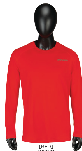
[RED] red print