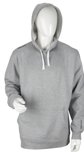
Heather Grey [HGR]