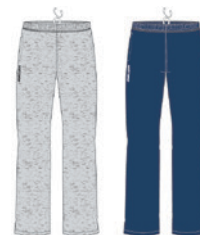
Heather Grey [HGR] Navy [NAV]

Soft brushed 80% cotton, 20% polyester 300 gram fleece sweatpant Concealed bungee cord closure at inside bottom hem for easy adjustability