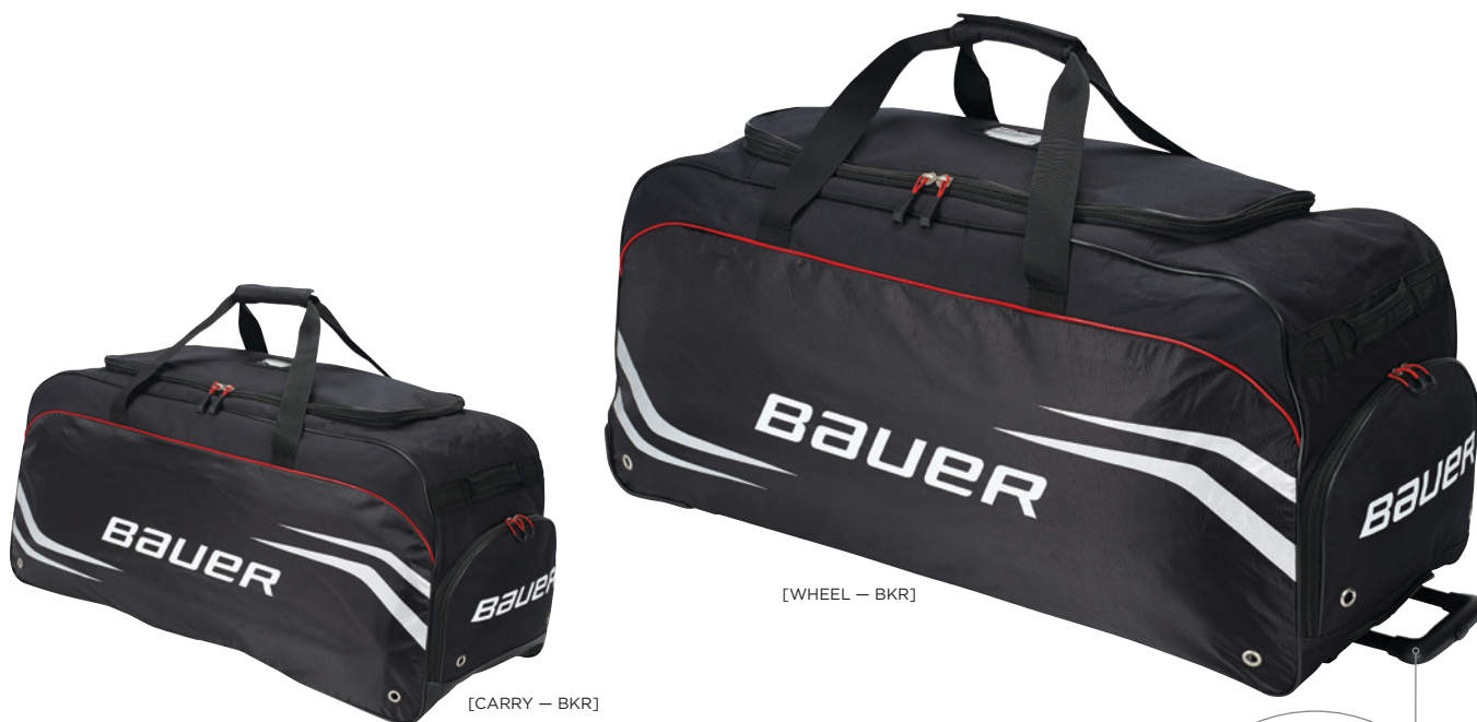
Internally constructed locking telescopic handle