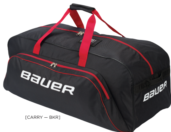
[CARRY — BKR]