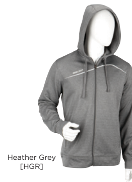
Heather Grey [HGR]