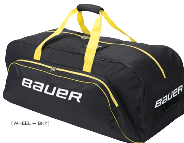
[WHEEL — BKY]