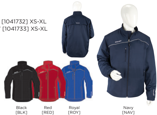
Black [BLK] Red [RED] Royal [ROY] Navy [NAV]

Durable, lightweight and breathable team jacket Inside mesh lining is treated with 3M™ Scotchgard™ Protector moisture wicking finish Back vent allows for better air flow & cooling