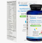
StellaLife® DentaMedica™ Supplements