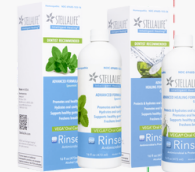
StellaLife® VEGA® Oral Care Rinse