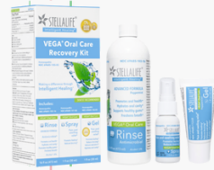
StellaLife® VEGA® Oral Care Recovery Kit