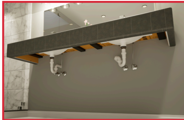
6. Apply a layer of thin-set and your choice of finished product.