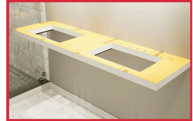
4. Cut holes for sinks in preferred locations.