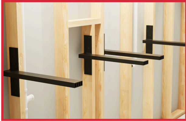
1. Install brackets at the desired height using the provided hardware. Ensure they are level and securely attached.