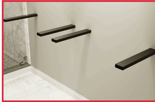
2. Apply Dry Wall.