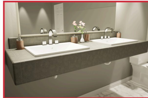
7. Enjoy your new Free Floating Vanity!