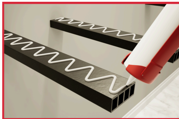
3. Apply adhesive to the brackets, and place the board on top.