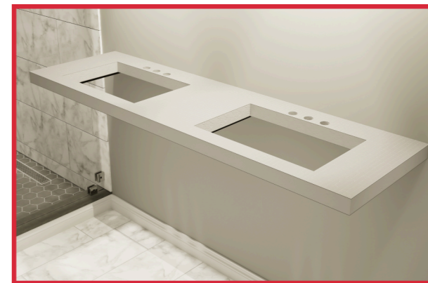
4. Cut holes for sinks in preferred locations.