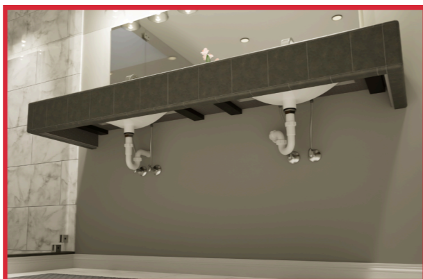
6. Apply a layer of thin-set and your choice of finished product.