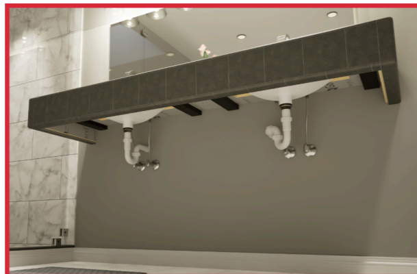
6. Apply a layer of thin-set and your choice of finished product.