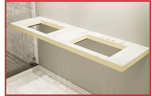
4. Cut holes for sinks in preferred locations.