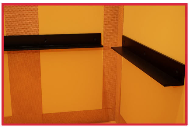
2. Install brackets at desired height using the provided hardware. Ensure they are level and securely attached.