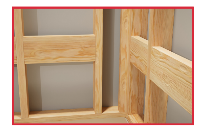
1. Install blocking at desired height between pre-existing wall studs. Apply wall board according to manufacturer specifications.