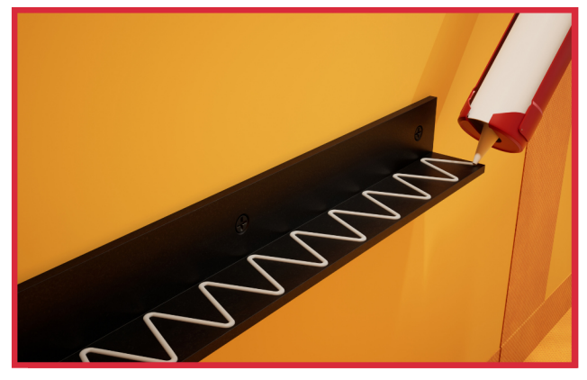
3. Apply Kerdi Fix to the brackets and set the first board onto the brackets.