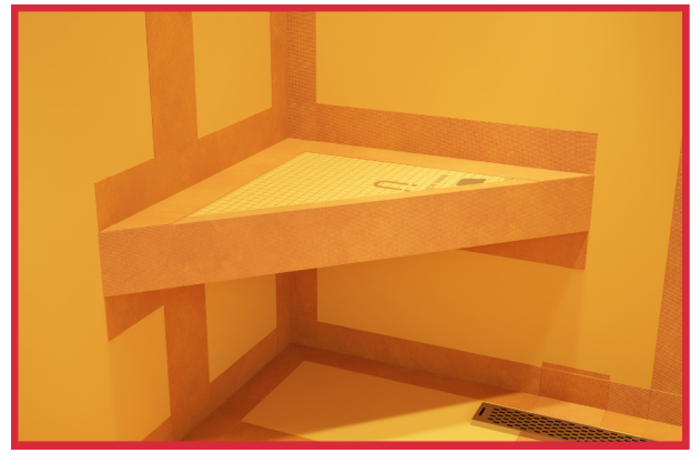
6. Apply a layer of thin-set then wrap the exposed sides in the provided Kerdi Band.