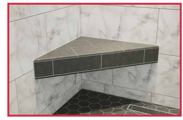
7. Install your preferred tiling and enjoy!