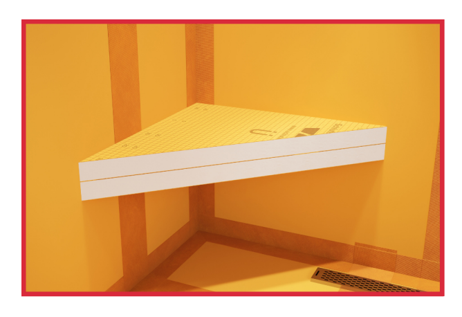
5. Place the second board on top of the first board with the Kerdi Fix in between both boards.