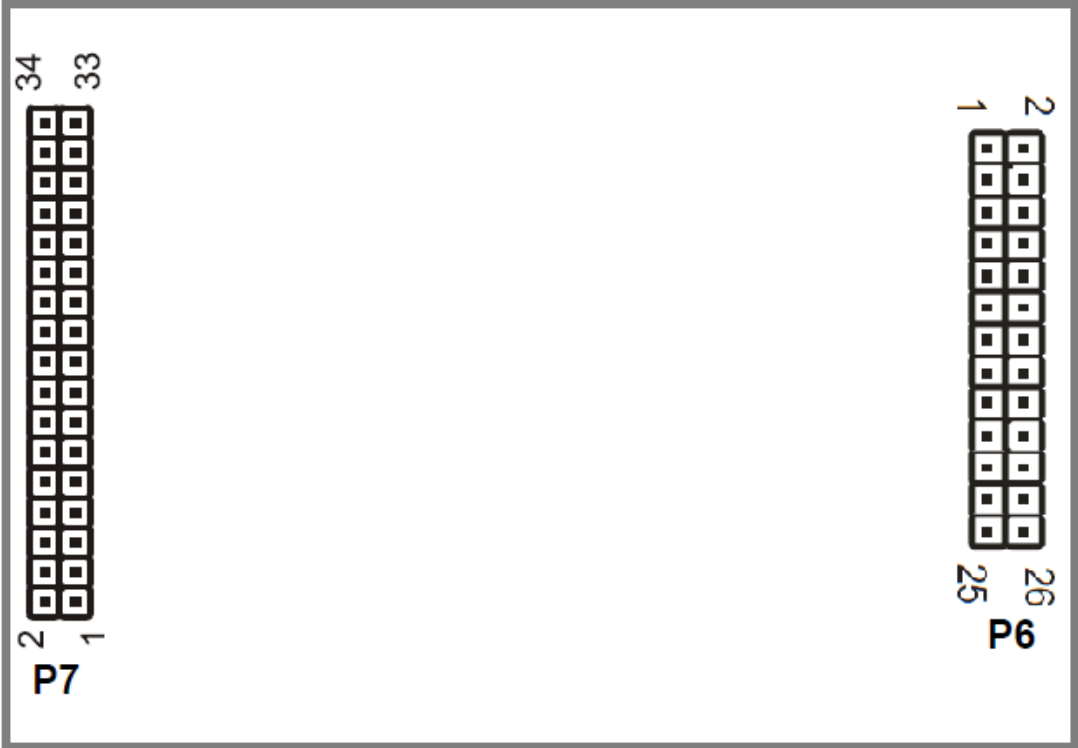
Figure 6-2: TTL I/O Pin Assignments (P7)