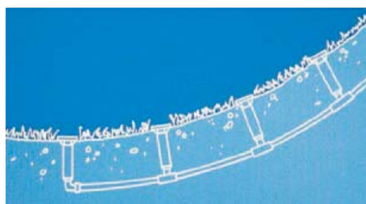
With SAM check valve

areas with changing elevation/water pressures or in areas exposed to vandalism.