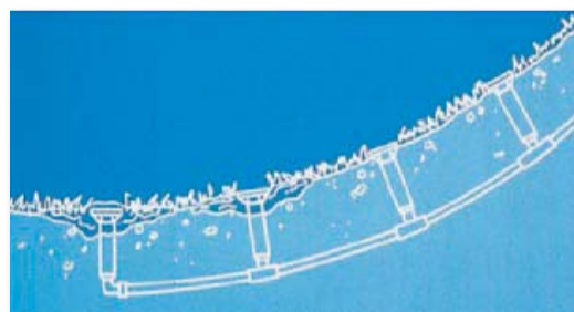
Without SAM check valve

Seal-A-Matic™ (SAM) check valve to prevent low head drainage