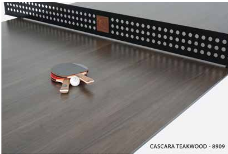
CASCARA TEAKWOOD - 8909