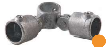
A48 CORNER SWIVEL