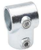
A2 SHORT TEE