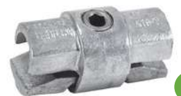
A9 INTERNAL JOINER