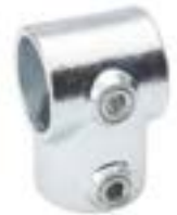
A2 SHORT TEE