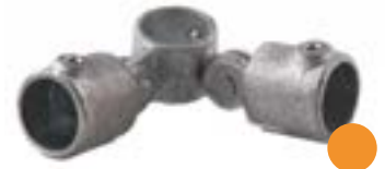
A48 CORNER SWIVEL