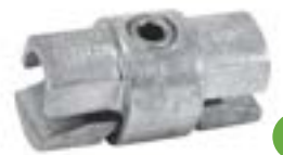
A9 INTERNAL JOINER