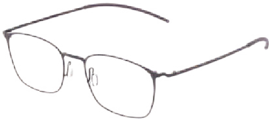
SB82009 (52□18-145) Stainless Steel MB Matte Black