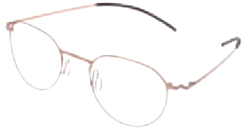
SB82108 (49□21-145) Stainless Steel BP Brushed Pink