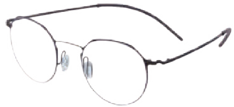
SB82302 (48□22-145) Stainless Steel MM Matte Mocha