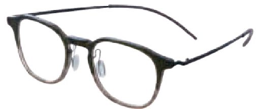
SB82304 (48□22-145) Acetate / Stainless Steel KGH – MB Khaki Gradient / Matte Black