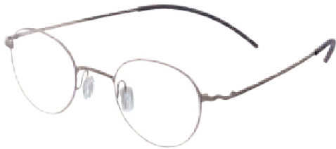
SB82301 (45□23-145) Stainless Steel BP Brushed Pink