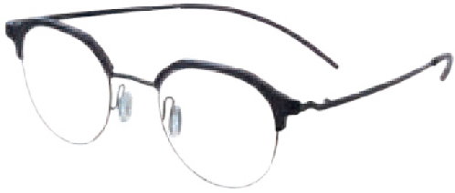
SB82305 (48□22-145) Acetate / Stainless Steel TGY – GY Trans Gray / Gray