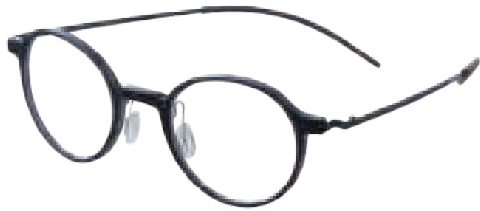
SB82210 (46□23-145) Acetate / Stainless Steel TBK-GY Trans Black / Gray