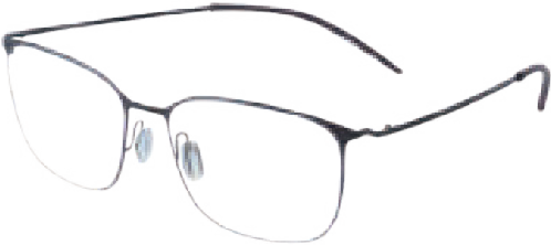
SB82307 (56□16-145) Stainless Steel GY Gray