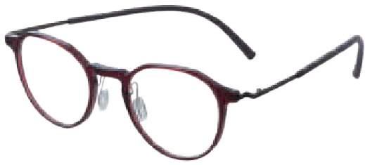
SB82209 (49□21-145) Acetate / Stainless Steel TBU-MM Trans Burgundy / Matte Mocha