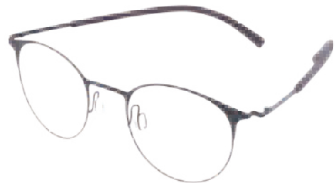
SB82206 (49□21-145) Stainless Steel MB Matte Black