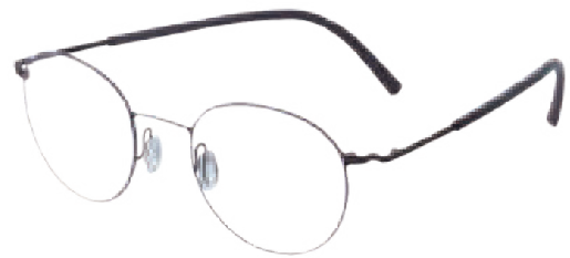
SB82303 (48□22-145) Stainless Steel MM Matte Mocha