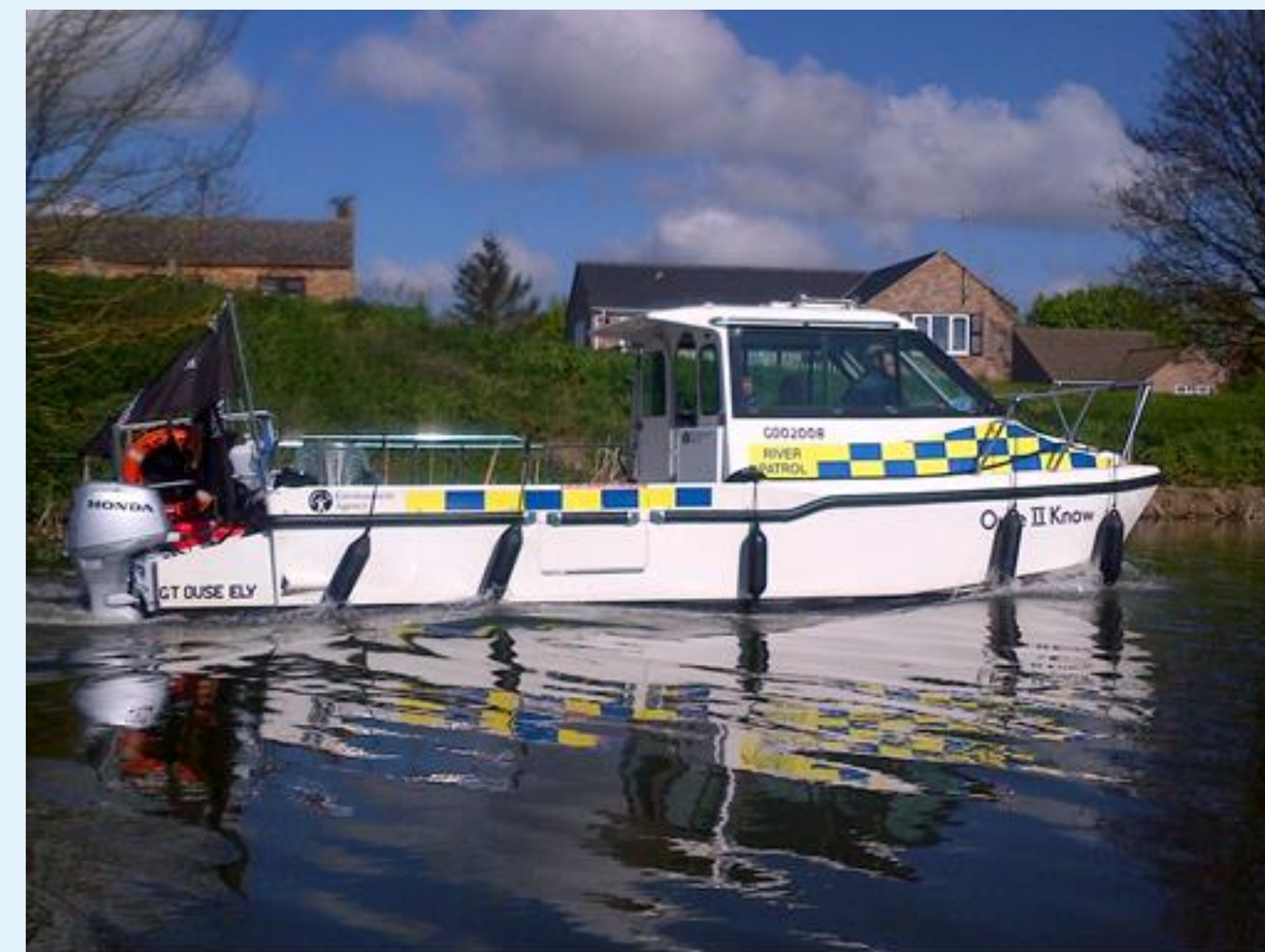
A current catamaran in the fleet, at hermitage lock on the R. Great Ouse, as the basis for a net zero redesign

In addition to electric propulsion, we are conscious of various alternative power and propulsion solutions for the EA to be aware of as we develop our strategies for sustainable boating. There are a wide variety of vessels on our waterways and, just like road vehicles, there is a cost to changing to electric. We have to be mindful that there isn't a 'one size fits all approach' at the moment, but making the changes in the right direction more accessible to all in some way should be a priority.