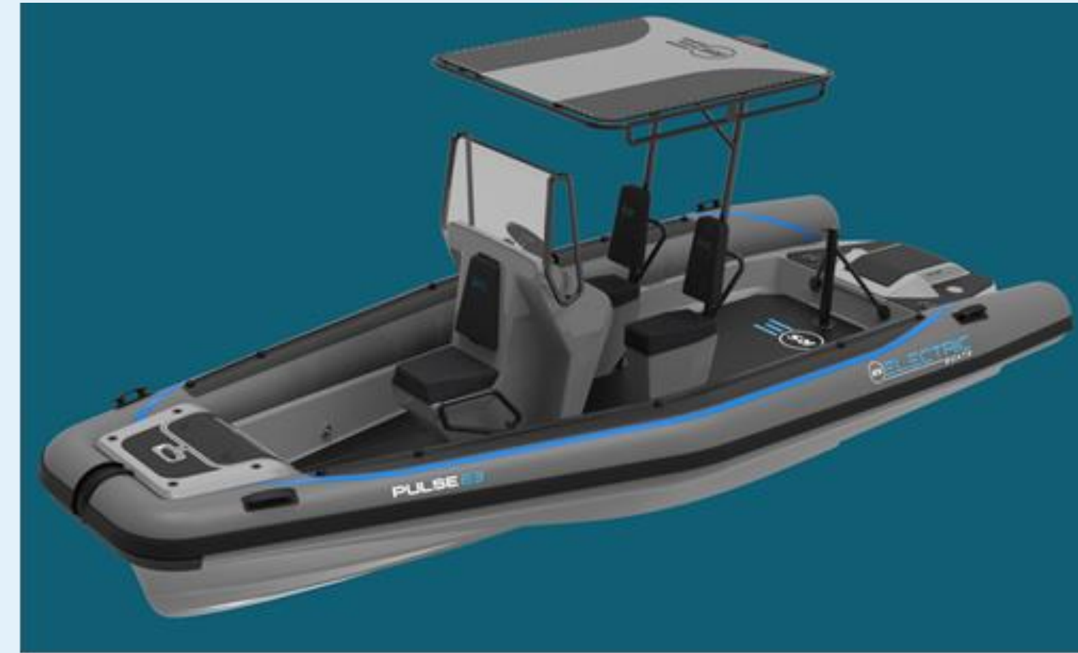
Early stock designs of the pulse 63 ribs, updated designs are currently in progress

We will also be installing two fast-chargers during the trial, which will become available to the public and form part of our infrastructure to support electric-propulsion as one of the key avenues to sustainable boating. For more information on the electric boat trial, please visit: Environment Agency wins bid for net zero workboats on Thames - GOV.UK (www.gov.uk)