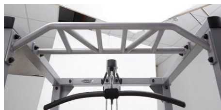
Optional for lat attachment and stacks