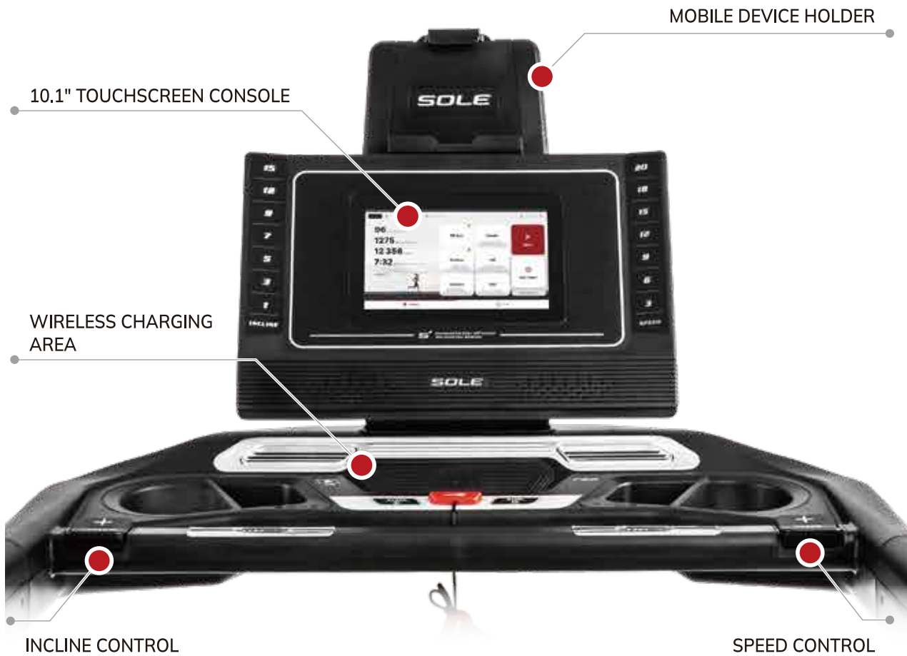
MOBILE DEVICE HOLDER