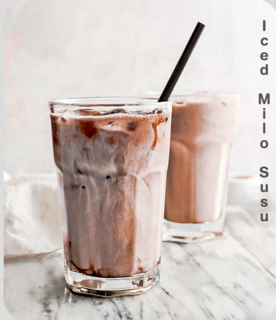
Iced Milo Susu