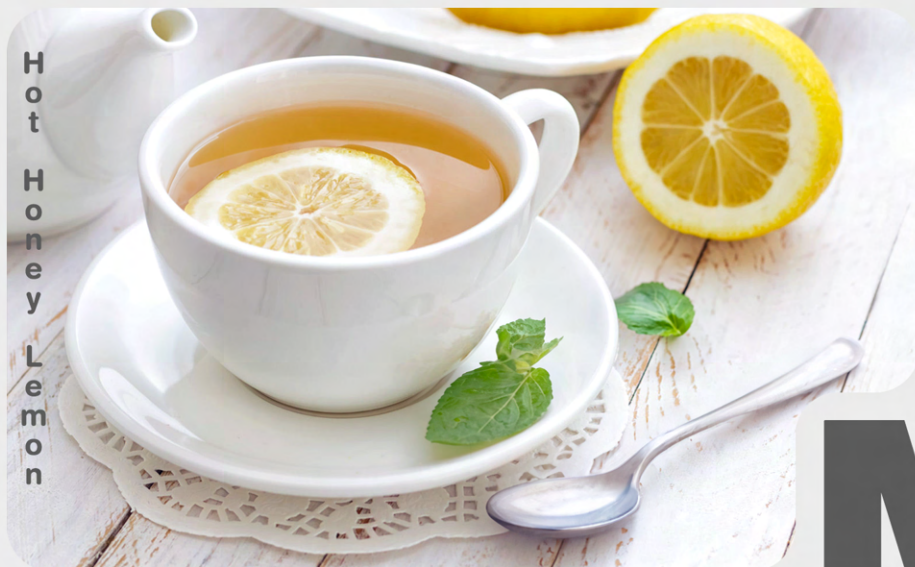
Hot Honey Lemon