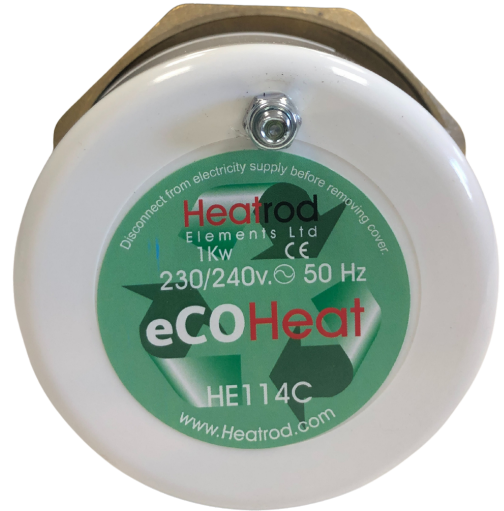
eCo Heat low wattage immersion heater

Bespoke designed eCo Heat immersion heaters available on request. Please do not hesitate to contact us.