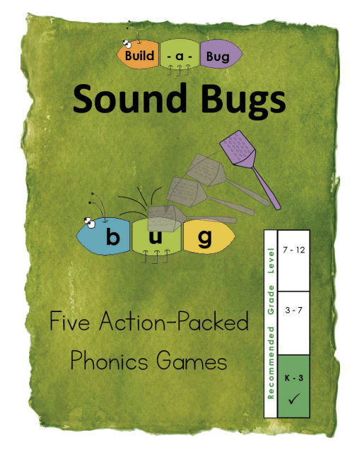
Sound Bugs provides more indepth sound-to-symbol practice and games.

Visit our website for a free download on the short vowel sounds and watch our videos.