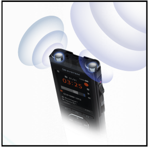
Intelligent two microphone system