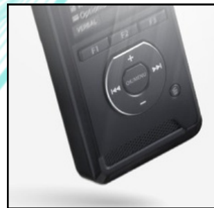
Resilient in everyday dictation