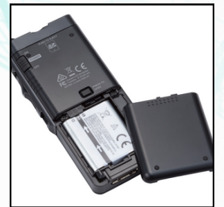
Rechargeable Lithium-ion battery

The DS-9100 offers advanced features such as superior audio beam forming noise cancellation, 256-BIT AES file encryption, streamlining workflow and enhancing dictation management efficiency. Its intelligent dual microphones effectively prioritize the speaker's voice and suppress ambient noise in various settings such as offices and hospitals. The triple-layer studio-quality filter guarantees precise voice capture whilst minimizing unwanted sounds such as breath and wind vibrations. This results in superior accuracy, ultimately improving workflow efficiency.