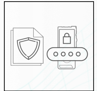
256-BIT Encryption and 4-Digit PIN Lock