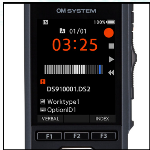
Full color screen