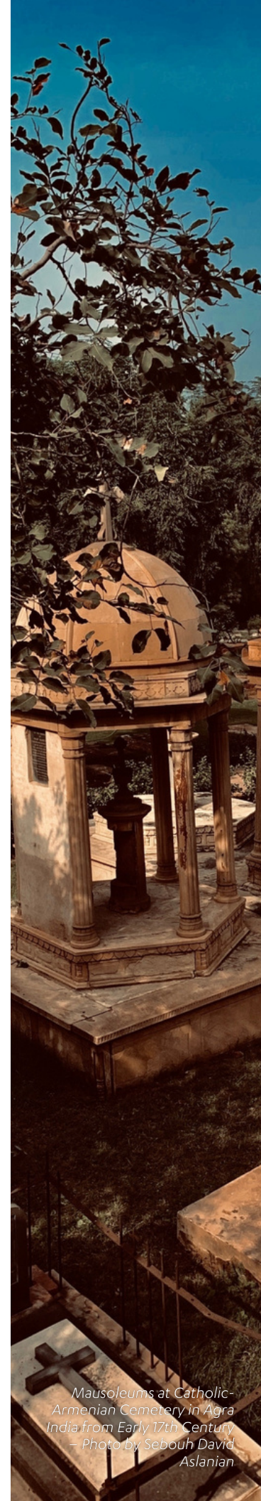
Mausoleums at Catholic-Armenian Cemetery in Agra India from Early 17th Century

FOR CONFERENCE PARTICIPANTS AT PROFESSOR ASLANIAN'S HOME