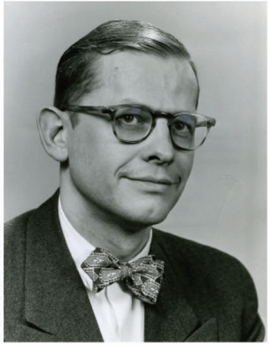
Prof. Richard Frye, ca. 1955

Speaking before a capacity audience of over 150 ASA members and Armenian students from Greater Boston colleges, Dr. Frye maintained that Armenian studies should receive the same status as that of any other people and should