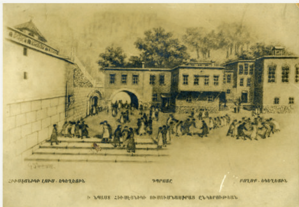
An image of Hussenig from the Deranian archive.