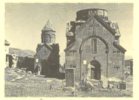
Ketcharis: the Katoghike Church and the St. Nshan Chapel.