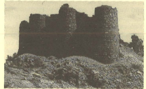
Amberd: Northwest facade with the towers.

• Talin, a 7th century cathedral with a finely sculptured arcade and one of the rare Armenian churches with paintings on the