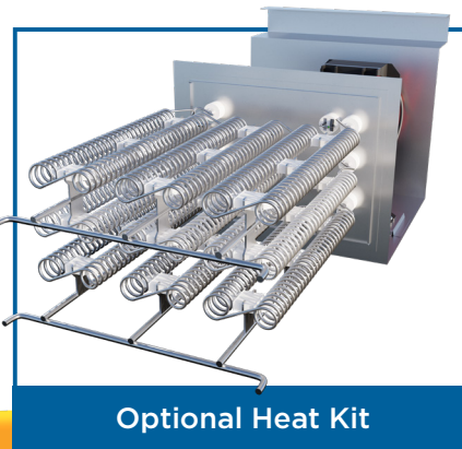
Optional Heat Kit