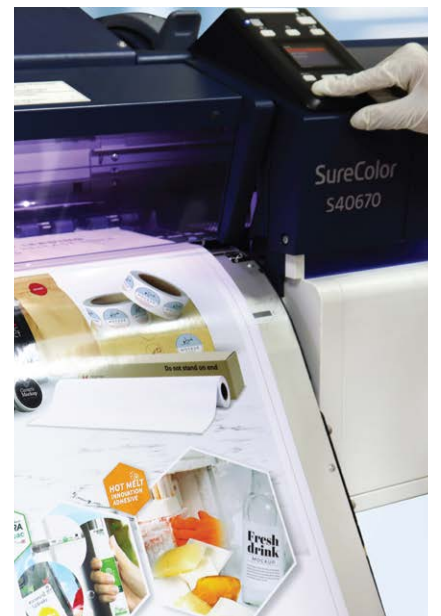
GRAPHIC & DIGITAL PRINTING