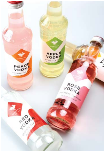
GENERAL PURPOSE (PERMANENT)

Variety of adhesives for customized applications