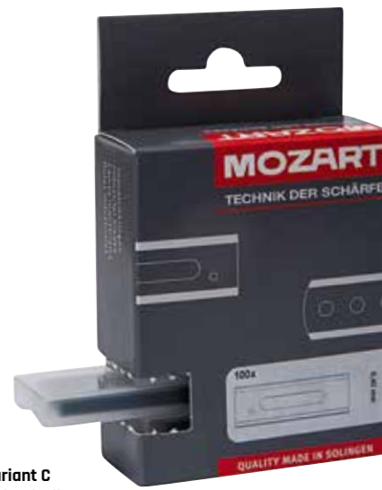
packaging variant C 10 blades in plastic dispenser