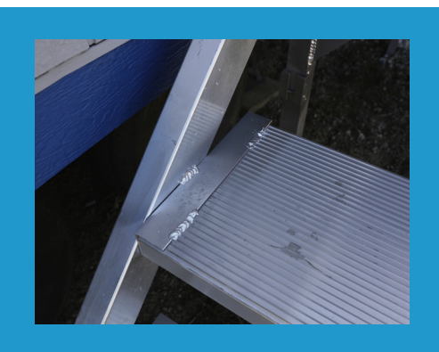
Welded, extruded riser for reinforced strength and a built-in, slip-resistant walking surface