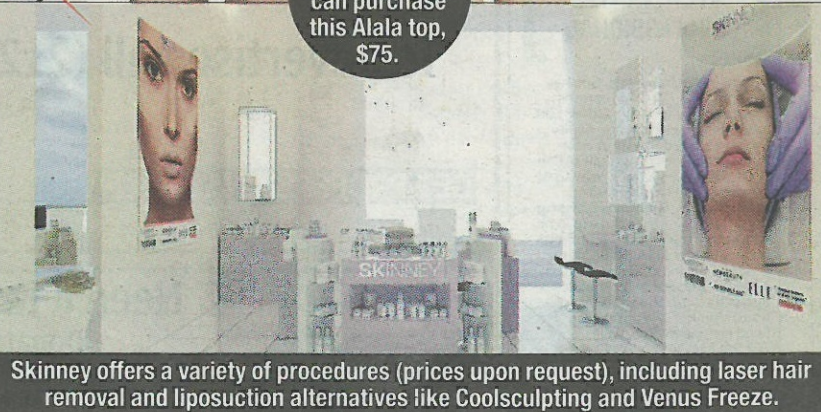
Skinney offers a variety of procedures (prices upon request), including laser hair removal and liposuction alternatives like Coolsculpting and Venus Freeze.