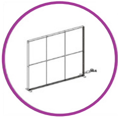
QTY: 2 9.8 x 7.4 Ft. BOOM Modular Lightbox Display