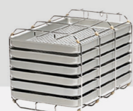
Mount C Plus for 6 standard trays

The mounts are designed for particularly easy handling in daily operation. If even 4 MELAstore® Boxes are to be held, these can also be easily inserted into the steam sterilizer without a mount.