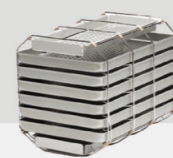
Mount E Plus for 6 standard trays and 2 small trays