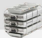
Mount F Plus for 3 MELAstore® Boxes 100 and 2 small trays