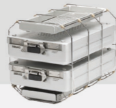
Mount D Plus for 2 MELAstore® Boxes 200 and 2 small trays