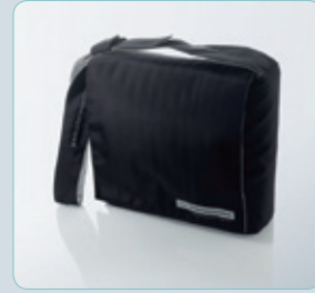
Dedicated carrying bag

The AS608 / AS608e includes a dedicated, light-weight carrying bag with shoulder strap that will accommodate the AS608 / AS608e, headset, and audiogram charts.