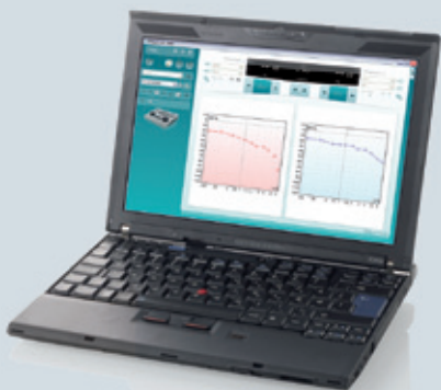
Diagnostic Suite software (AS608e only)

The AS608e includes the Hughson Westlake automatic pure tone test procedure. When the test is completed the results are easily recalled from the internal memory of the AS608e and displayed in the Diagnostic Suite PC software.