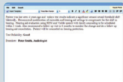
Report page from the Diagnostic Suite (AS608e only)