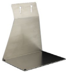
A813 Table Top Stand †