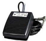
A803 Footswitch †